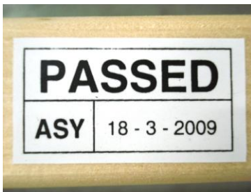
[Date Code Label]