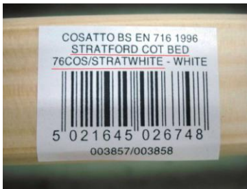
[Product Description Label (white)]

If not and you still own a Cosatto Stratford Cot bed, in either white or nut finish, please check the Product Description Label as shown in the picture. Then check the Date Code Label to see if your cot bed is affected. You will find these labels on the mattress base slats.